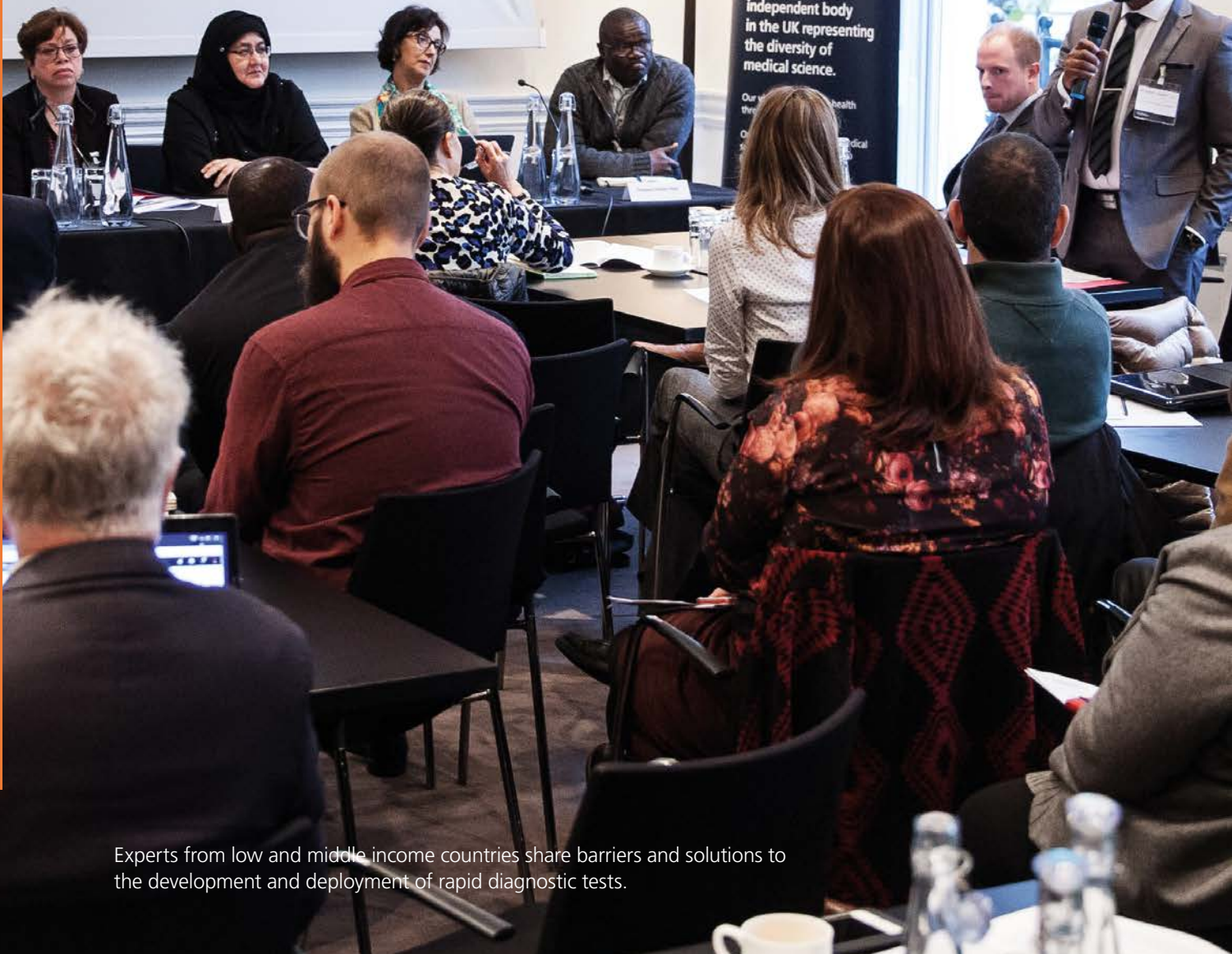
Experts from low and middle income countries share barriers and solutions to the development and deployment of rapid diagnostic tests.

The Academy of Medical Sciences Academy of Medical Sciences We are the independent body in the UK representing the diversity of medical science. Our vision is to improve health through the advancement of medical science.