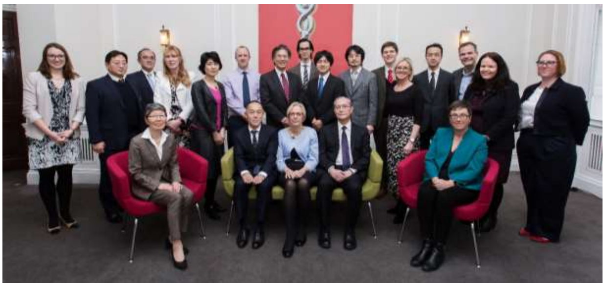
Speakers and co-Chairs at the symposium